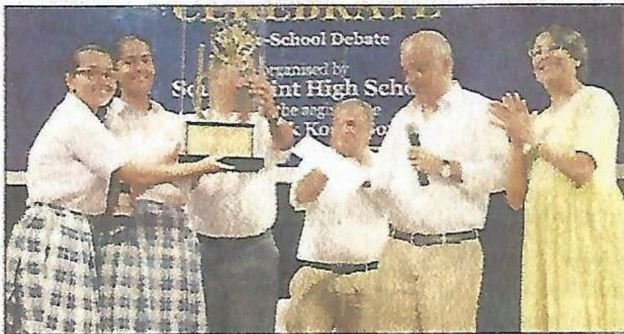
Students of Mahadevi Birla World Academy lift the trophy for Cerebrate, the debate competition