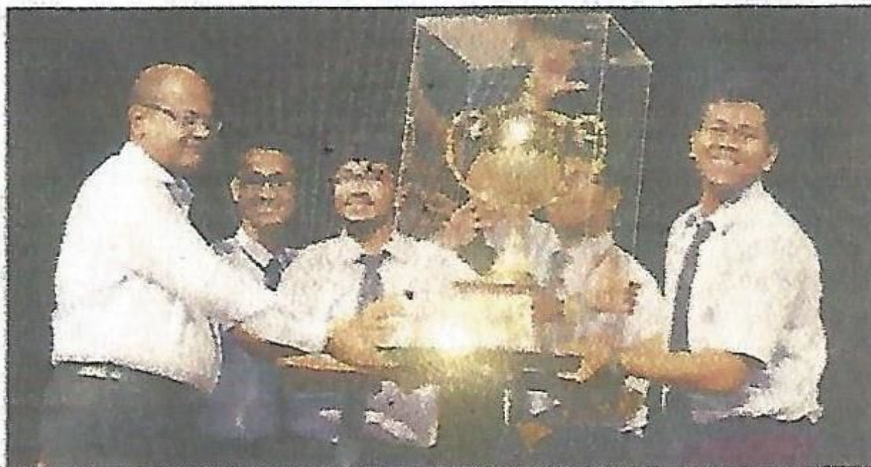
The team from South Point High School lifts the trophy for Q-point, the quiz contest