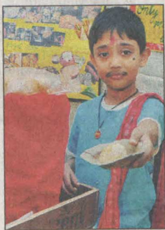
A little phuchka vendor at the South Point exhibition.

The three-day South Point Biennial Art and Craft Exhibition showcased more than 5,000 paintings and craftwork, including fabric paintings, canvases, clay sculptures, mixed media paintings, live experiments and more. The highlight of the exhibition was the models the students made for every subject ranging from Wordsworth's Lake District to the Indian Parliament.